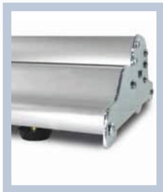
A stable design with feet that compensate for uneven surfaces.