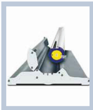
The image is well protected during transportation.

Roll Up Classic has been named a “work of applied art” by the Swedish Society of Craft and Design. The system is easy to transport and assembles in a flash for your presentation. Roll Up Classic is available in a wide range of widths and is ideal for repeated use in different environments.