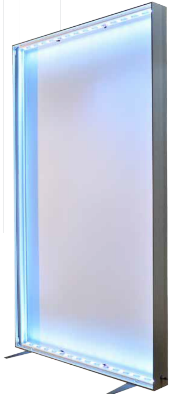
LED light strips

DURABLE: It features an eco-conscious lighting system and low energy consumption (60W for a 39" x 79" lightbox).